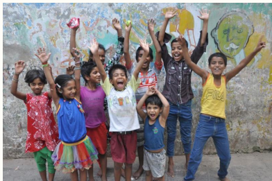
The children of New Light's Shelter.